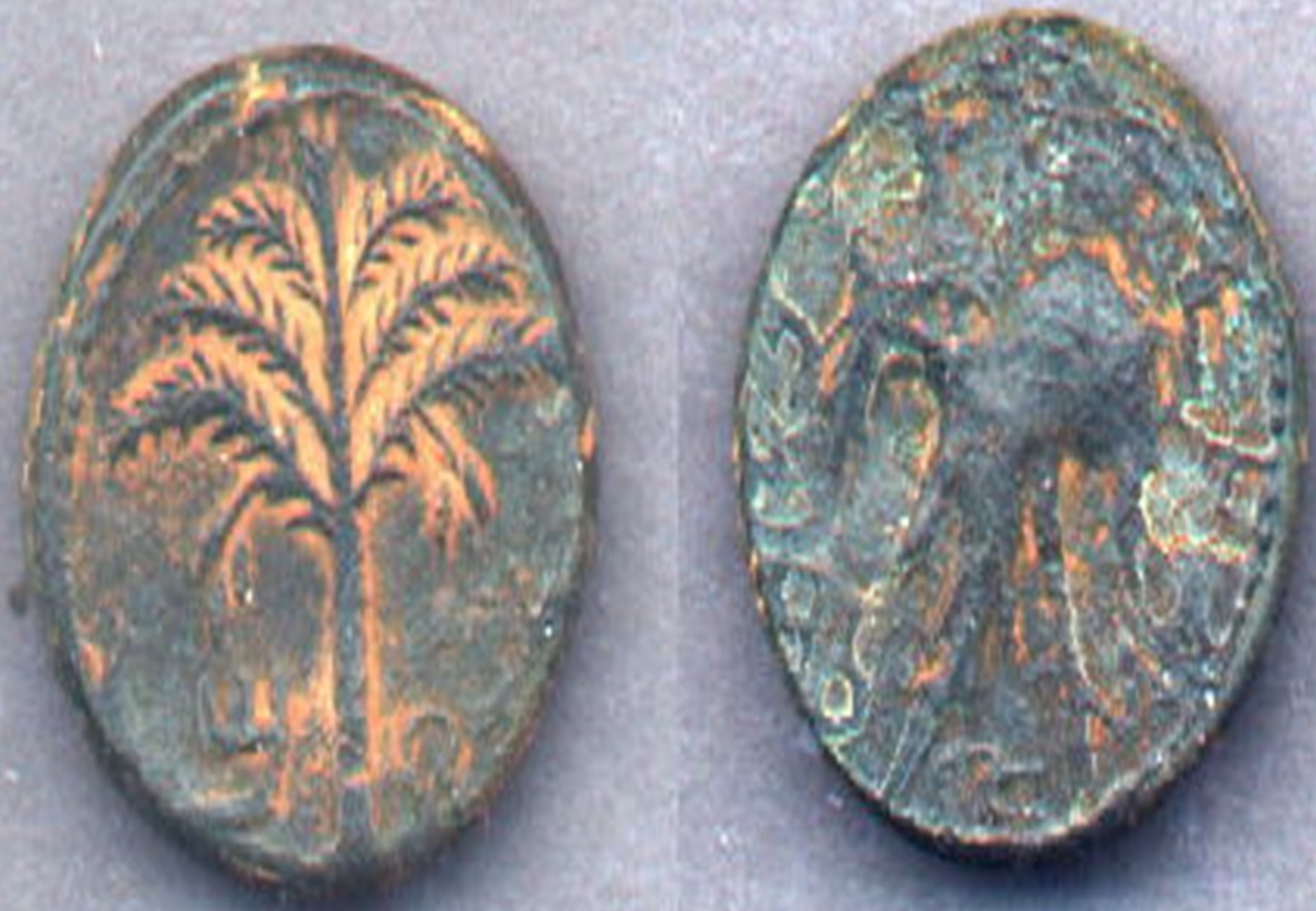
Coin from ancient Tyre.