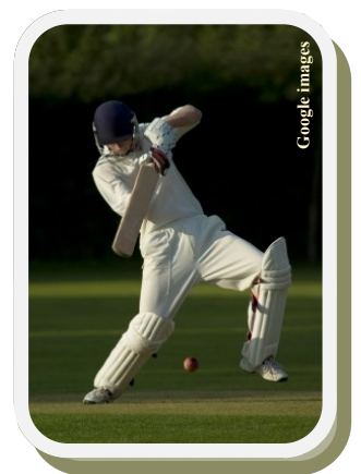
Batting (but not for ever!)

A cartoon appeared once in the now defunct magazine Punch . It was set in the Board Room of the headquarters of cricket and one faded old 'fossil' was saying to another: 'My idea of Heaven is batting for ever.' We all have our own ideas of Heaven and Hell but, if for one minute we could accept the old cricketer's Heaven, we could easily see that his 'Heaven' would be another's 'Hell', for someone would have to bowl at him for ever without the remote possibility of ever getting him out. Furthermore the batsman would soon tire of making good shots since no matter how sloppily he batted he could never fail. If you can't fail, there's no merit in succeeding. Besides which, cricket itself is a lot like Marmite; it sends out confusing signals and you either love it or hate it.