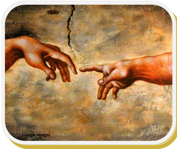
God made man in His image

Despite the awesomeness of the Creation and the consequences of all that was involved, God determined to do it, though it cost Him His Son on Calvary’s tree. This shows how precious we are to Him and just how high a value He places on our love. It also tells us how sad and angry He must be at those who refuse Him.