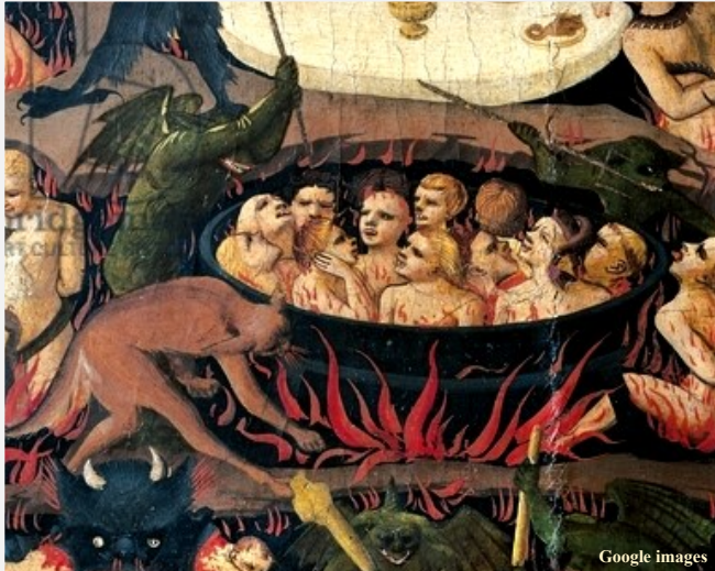
The sort of picture we instinctively reject as a reality

that we mortals would be more merciful than Almighty God. We would not condemn even a Hitler or a Judas to eternal Hell. We might force them somehow to atone for their sins over a long period, or we might annihilate them, but we could never so mistreat anybody by torturing them for ever.