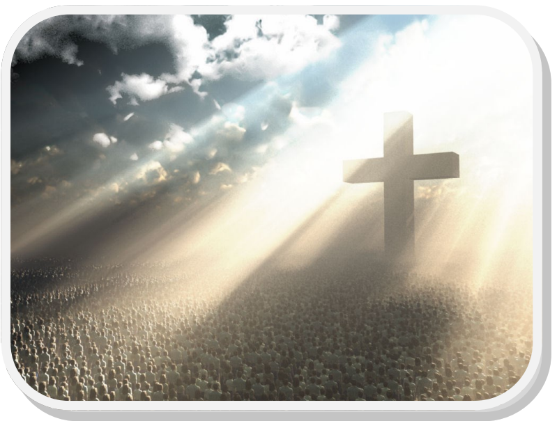
Approaching the throne of God

Since God cannot annihilate them, He can only