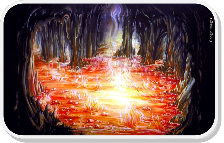
The Lake of Fire

The concept of a biblical Hell in many people's minds runs directly counter to their concept of a God of love. Hell, however, is a biblical teaching and surprisingly for many it is mainly found on the lips of Jesus Himself, e.g. Luke 12:5, Mt. 25:1-46, etc., and is vividly portrayed in Revelation 20:7-15. Let us look at the latter passage, the earlier part of which we have encountered in our study on the Millennium (No. 13). 'And when the thousand years are ended, Satan will be released from his prison and will come out to deceive the nations that are at the four corners of the earth, Gog and Magog, to gather them for battle; their number is like the sand of the sea. And they marched up over the broad plain of the earth and surrounded the camp of the